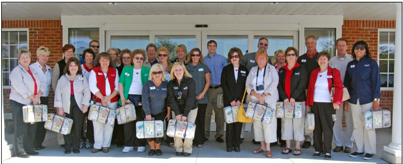
SHORE TOUR: Virginia Welcome Center Staff - What an honor to show off the Shore from stem to stern to the team that provides travel advice to over 3 million Virginia visitors annually. Last fall, the TC ran the 2009 Virginia Tourism Familiarization Tour for Virginia Welcome Center staff from across the state with the help of many partners including: New Church W.C. Chincoteague & Northampton Chambers, Bay Creek, & Onancock Business & Civic Association.

To download the registration form click here