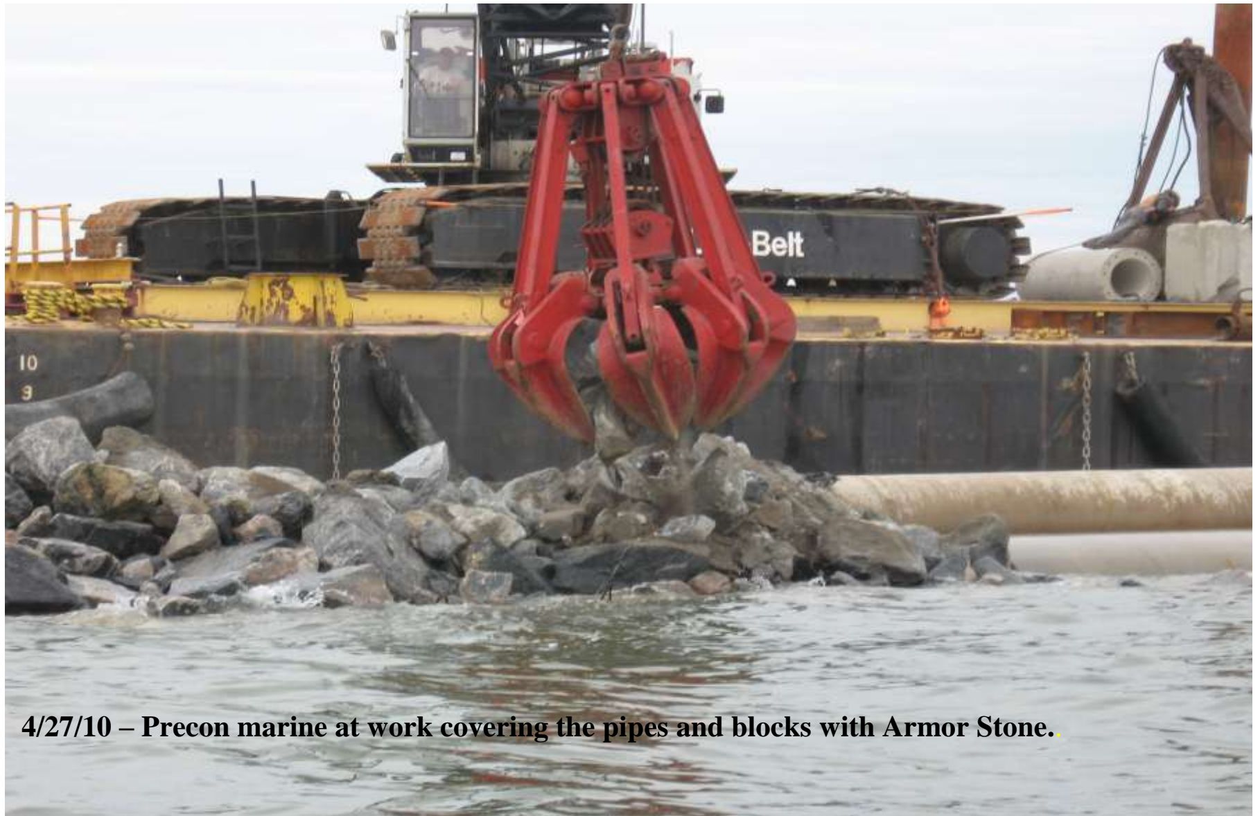
4/27/10 – Precon marine at work covering the pipes and blocks with Armor Stone.